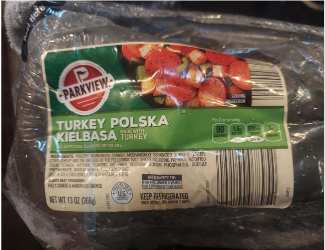
Label on front of package: