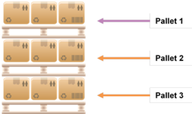
Figure 3- Stacked Pallets