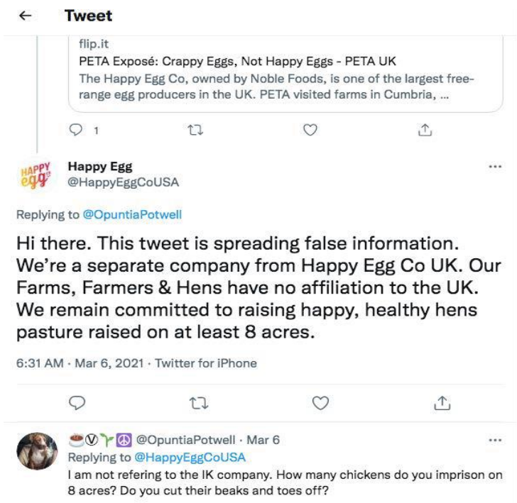
1 Figure 6

2 3 4 5 6 7 8 9 10 11 12 13 14 15 16 17 18 19 20 21 22 23 24 25 26 27 28